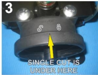
3 SINGLE CUT IS UNDER HERE LOCATE THE LOCK SYMBOLS ON THE MOUNTING BASE. THE SINGLE CUT IS LOCATED EXACTLY IN THE MIDDLE OF THE 2 LOCK SYMBOLS